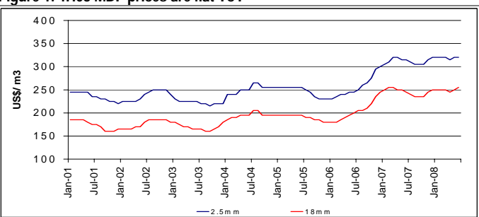
Figure 1: 1H08 MDF prices are flat YoY

Pre-tax profits fell 31% YoY due to higher glue costs, higher raw material costs, a weaker US$/RM and also start-up costs for its Indonesian MDF plant and glue plant in Malaysia (which, according to management, is expected to drive cost savings in subsequent quarters).